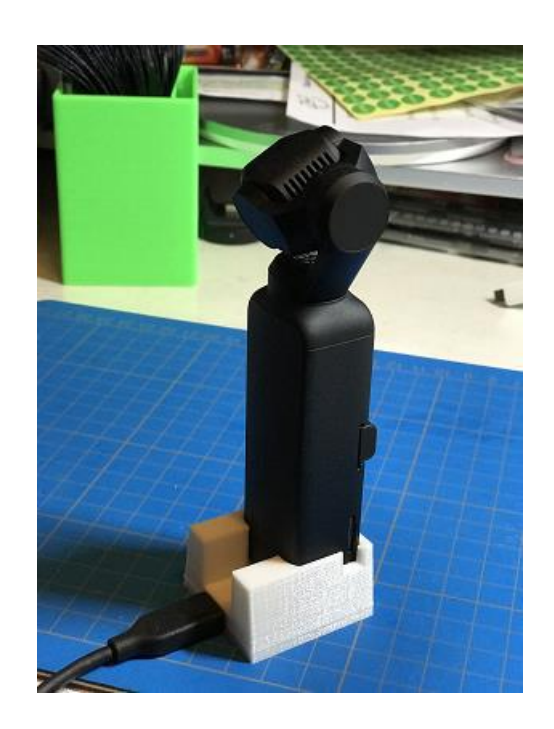
Figure 3: Example of using the USB3.1-CMV-CF-V1A to build a USB3.1 Type C charger dock with 3D printed case.