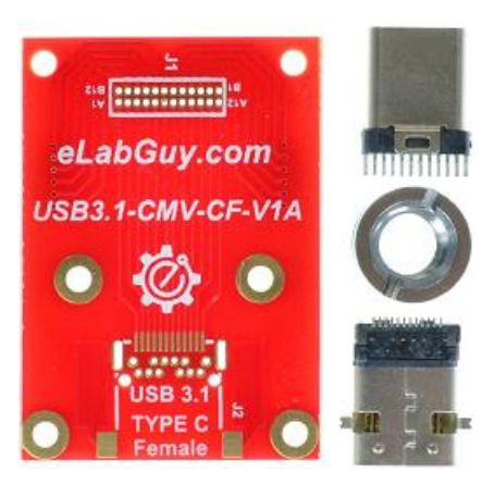
Figure 1: Parts inside the kit (Note: the module is not assembled)